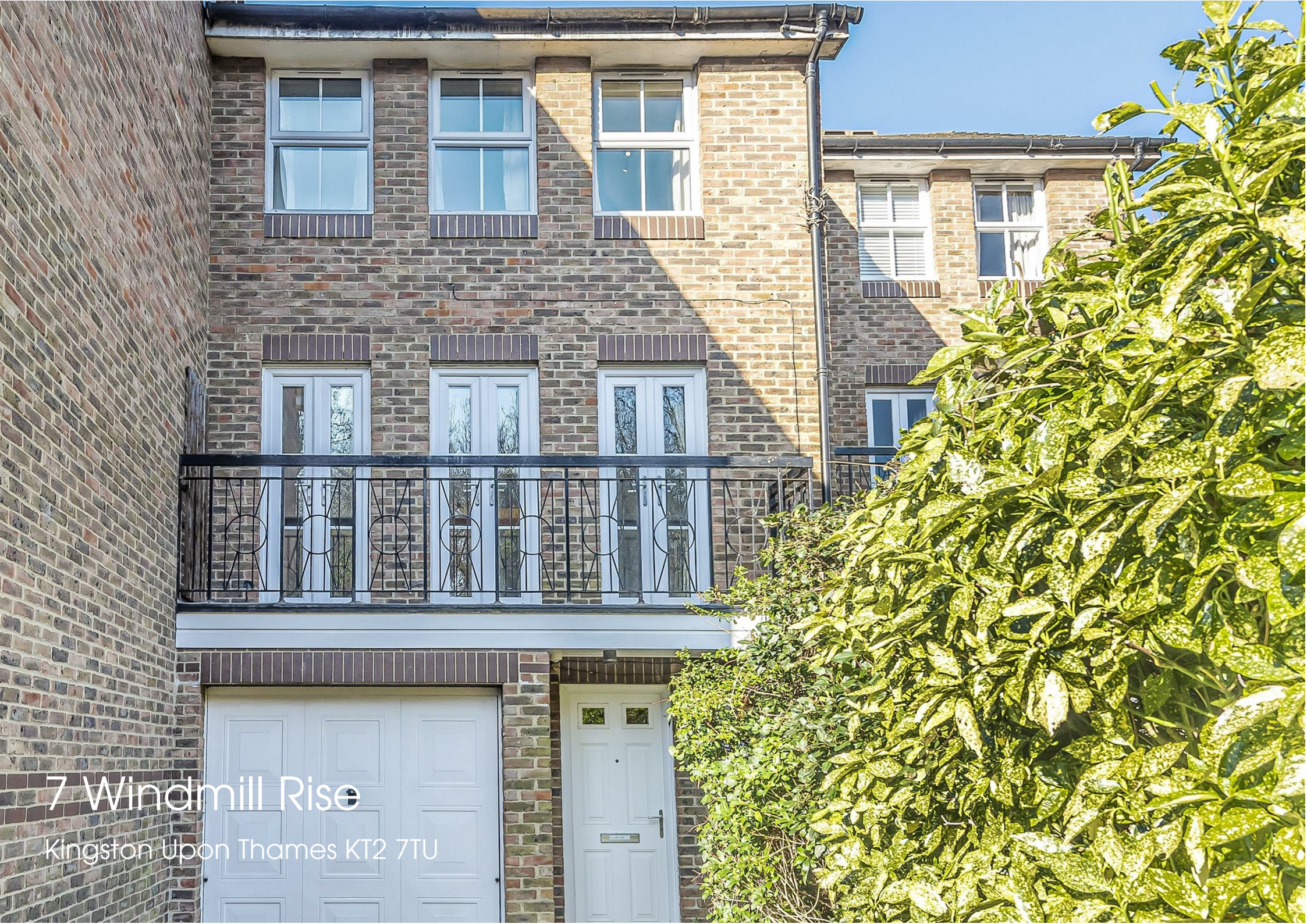
7 Windmill Rise Kingston upon Thames KT2 7TU

34 Richmond Road Kingston upon Thames Surrey KT2 5ED www.gibsonlane.co.uk Tel: 020 8546 5444